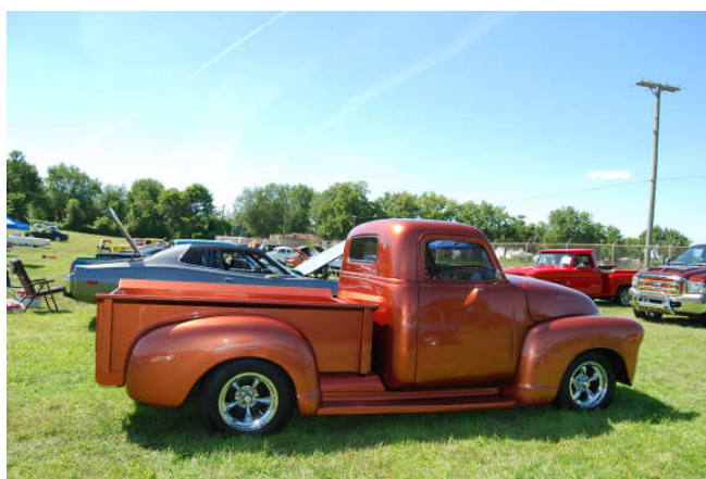
Best Truck - '47 Chevy Pickup