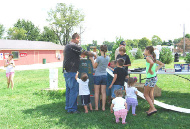
The Race Director Was A Real Popular Guy