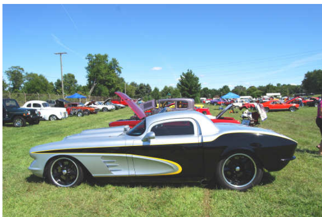
Best Engine - Homebuilt '62 'Vette