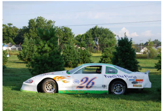
They Weren't All Trailer Queens