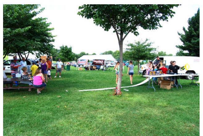
Watching The Hot Wheels Race Set-up