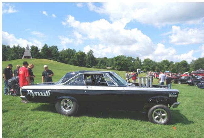
Best of Show - '65 AFX Belvedere