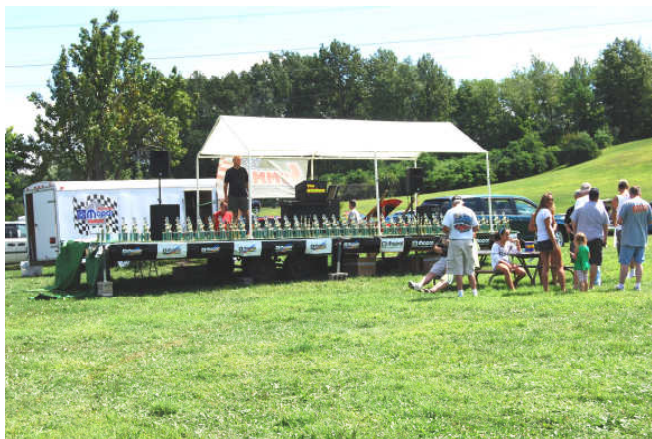
"The Hitman" Surveys The Crowd