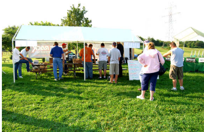
First Thing - You Gotta Pick A Class