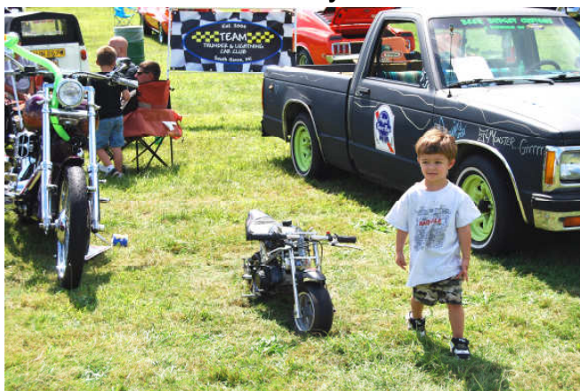
Our Bikers Come In All Sizes