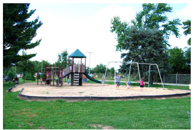
There Were Other Things To Keep The Kids Busy