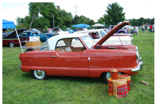
How About A Picnic On The Grass?