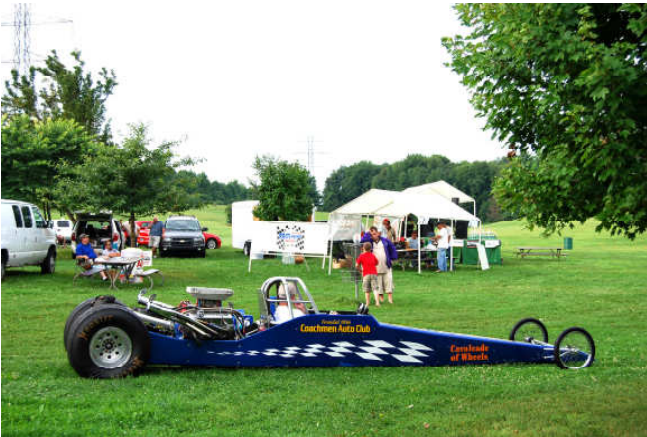
But They All Looked Good, Just The Same