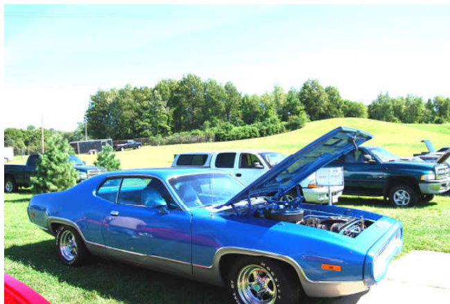
Best Club Car - '72 Satellite Sebring