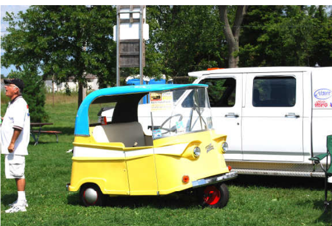
Yep - We Had All Kinds Of Vehicles