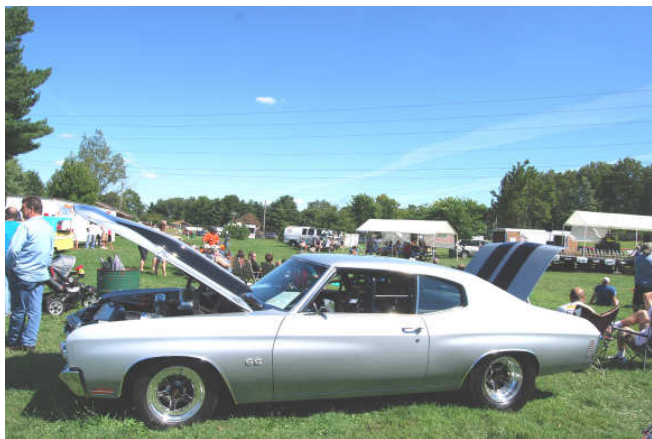
Best Paint - '70 Chevelle SS