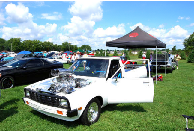
I'll Bet This One Will Really Move!