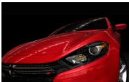
New Dodge Dart R/T