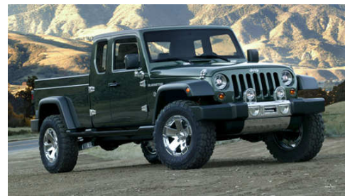
Jeep Gladiator Pickup